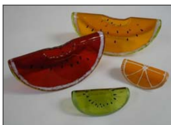
"Rockin' Fruit" Series

If you've wanted to make your own fused and slumped glass projects, this NEW Summer & Fall Glass Workshop is for you! This weekly format is an easy, affordable way for glass fans to design, cut, and fire new creations, without the expense of buying a kiln. This 'Open Studios' format is ideal for students who can already make straight and curved glass cuts &/or want instructor guidance for more advanced fused glass projects. Each week, you'll have 3 hours to work on your own projects to prepare for kiln firing. First-come, first-served to save kiln space for your unique gift items or personal artwork. Includes demonstrations, instructor coaching and use of glass tools.